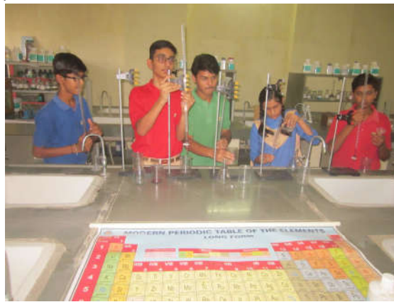
SETTING UP SKILLS