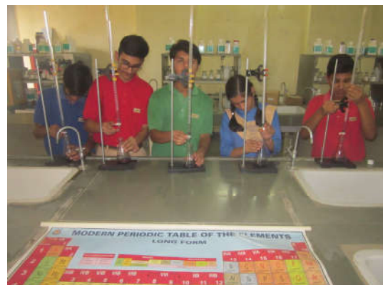
EXPERIMENTATION AND OBSERVATION SKILLS