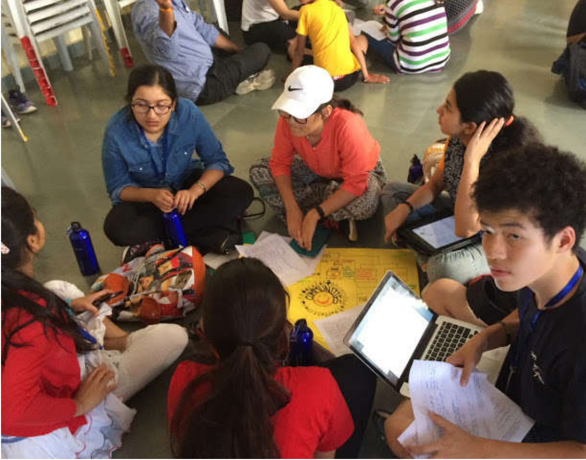
Analysing feedbacks about group project