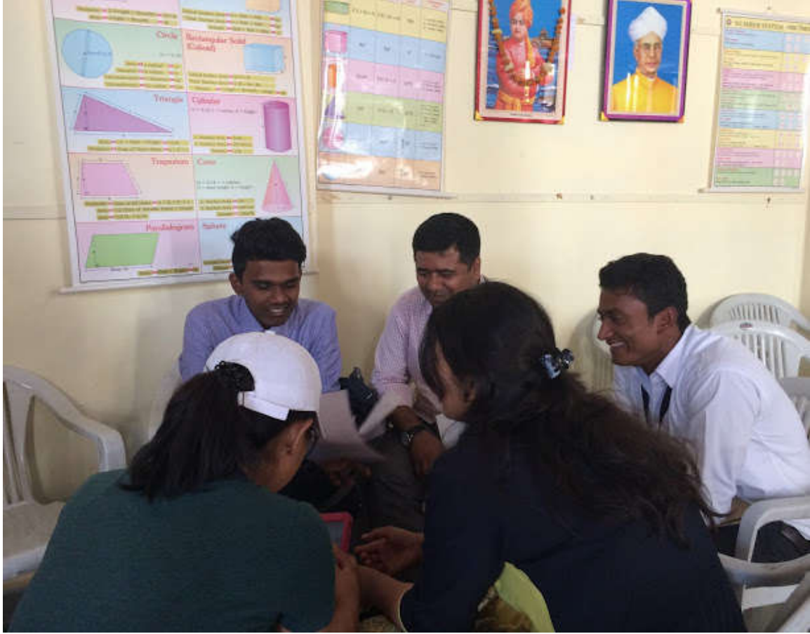
Engaged in serious discussion about project in group