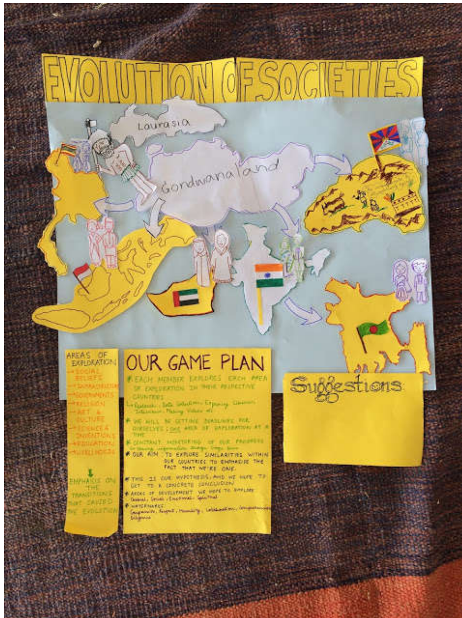
Chart prepared by Evolution of societies group

As usual, at 8:00 am participants get together for morning meditation. This was followed by breakfast and started day's first session by working on project in group. At 10:45 am, we had group wise presentations by on the projects we have chosen. Firstly, environment group talked about organic farming. Thereafter, Livelihood and economy group talked about uplifting economy by ensuring livelihood for weaker sections of society. The aesthetics group talked about creating an online platform for sharing different arts. Then, community group talked about creating community in school and group working on evolution of societies talked about researching on evolution of human societies on the basis of socio-cultural evolution to bring out similarity so as to promote peace. Finally, philosophy group talked about brining harmony through philosophy