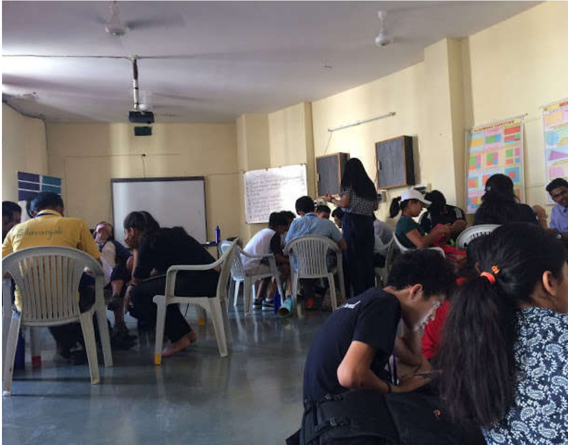
Discussion about project in the afternoon session in group