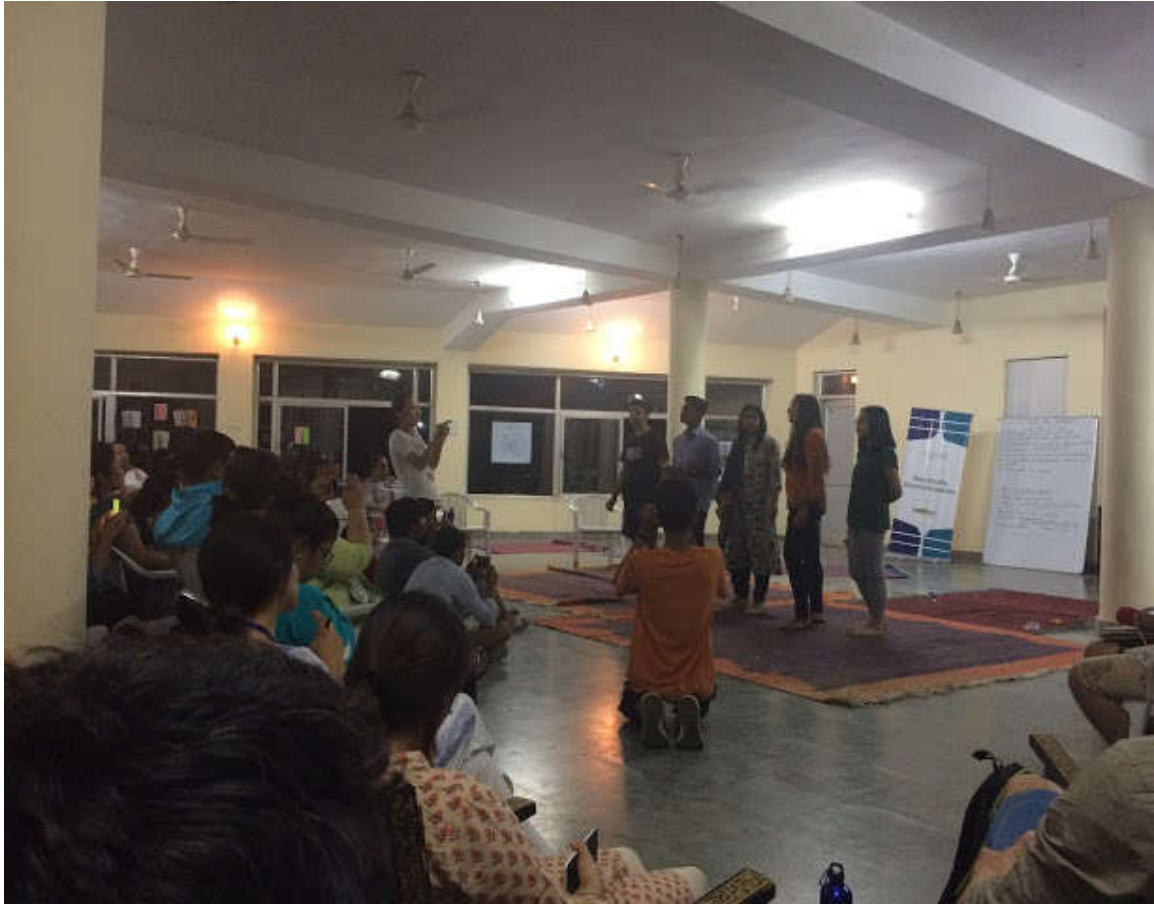
Singers - a passion group entertaining participant