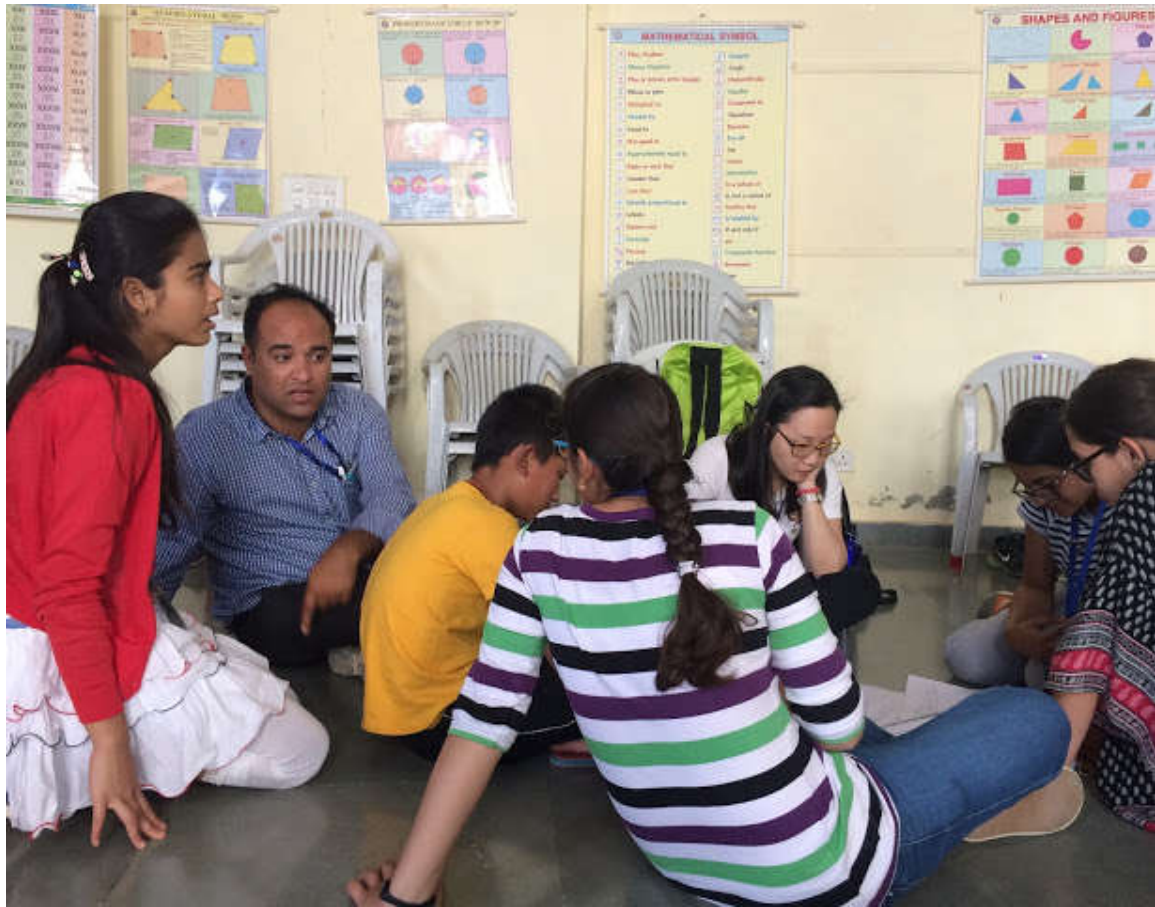
Discussing seriously about project work