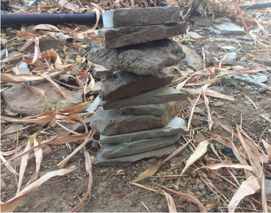
Ten stones in stack - an activity for treasure hunt game